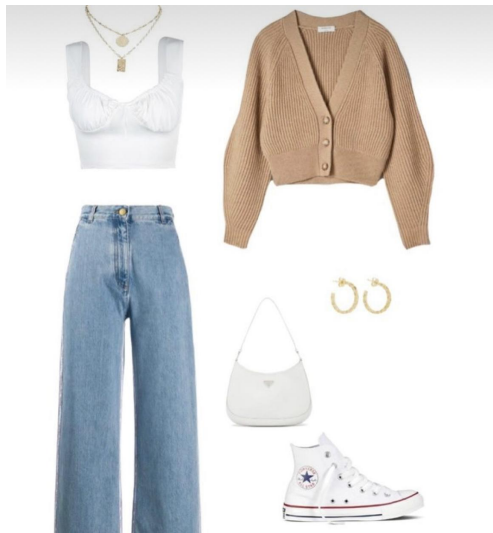
Figure 2:Retro 90's style