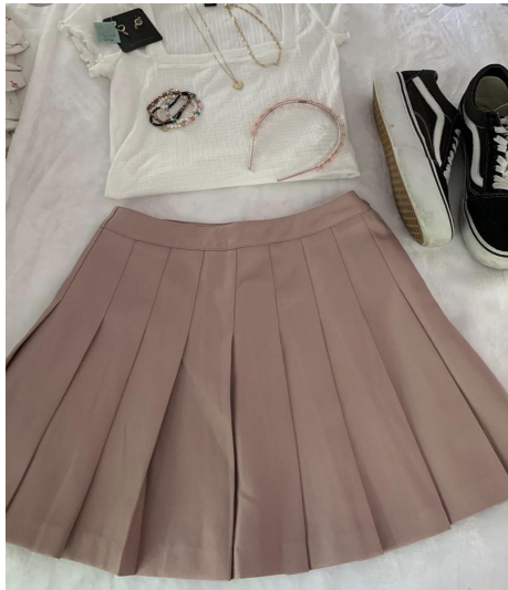
Figure 1:Soft girl style