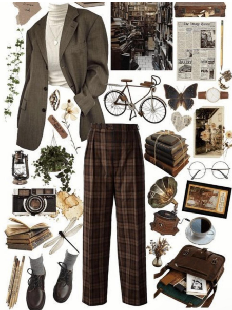
Figure 3:Light Academia style