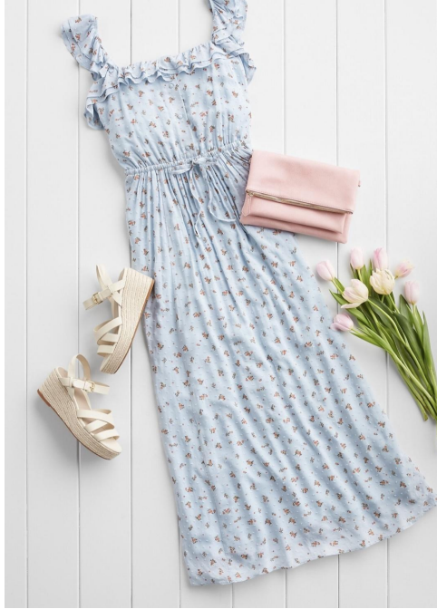
Figure 5:Cottage Core style