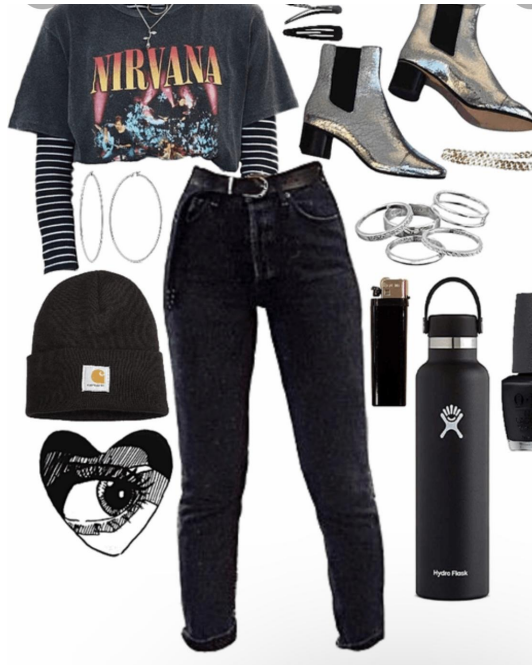
Figure 6:E-girl style